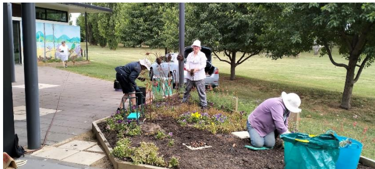
Hard at work – enthusiastic gardeners tidying up the front garden beds at TSC