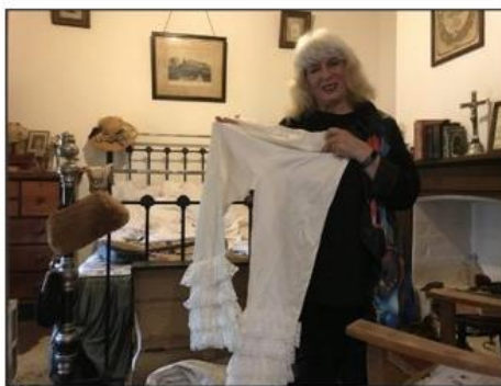
Antique underwear is always a hit with audiences.