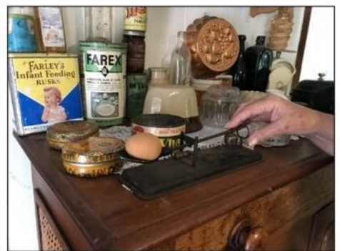
An old egg scale is one of the unusual items from the past.

Elizabeth styles herself as 'History with a Difference' and her ideas to enthuse people with older times are certainly different.