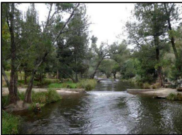
The river beside the Discovery Trail

Those who had more energy ventured up the hill where we had a closeup view of the dam wall. Further along we had a good view of the water behind the wall. We were surprised to learn that the dam is currently at 92% capacity.