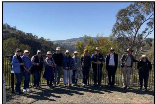
Taken at the top of the wall of the dam

Our walk this Sunday starts at the Old Tuggeranong School House in Chisholm. New walkers are always welcome.