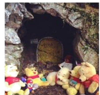
Some collective 'hugs' of teddy bears at Pooh Bear's Corner