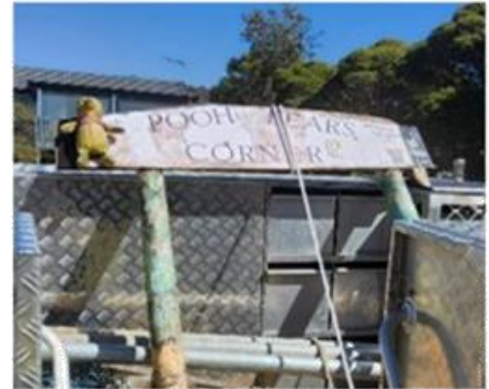
Pooh Bear's Corner – sign to be replaced!