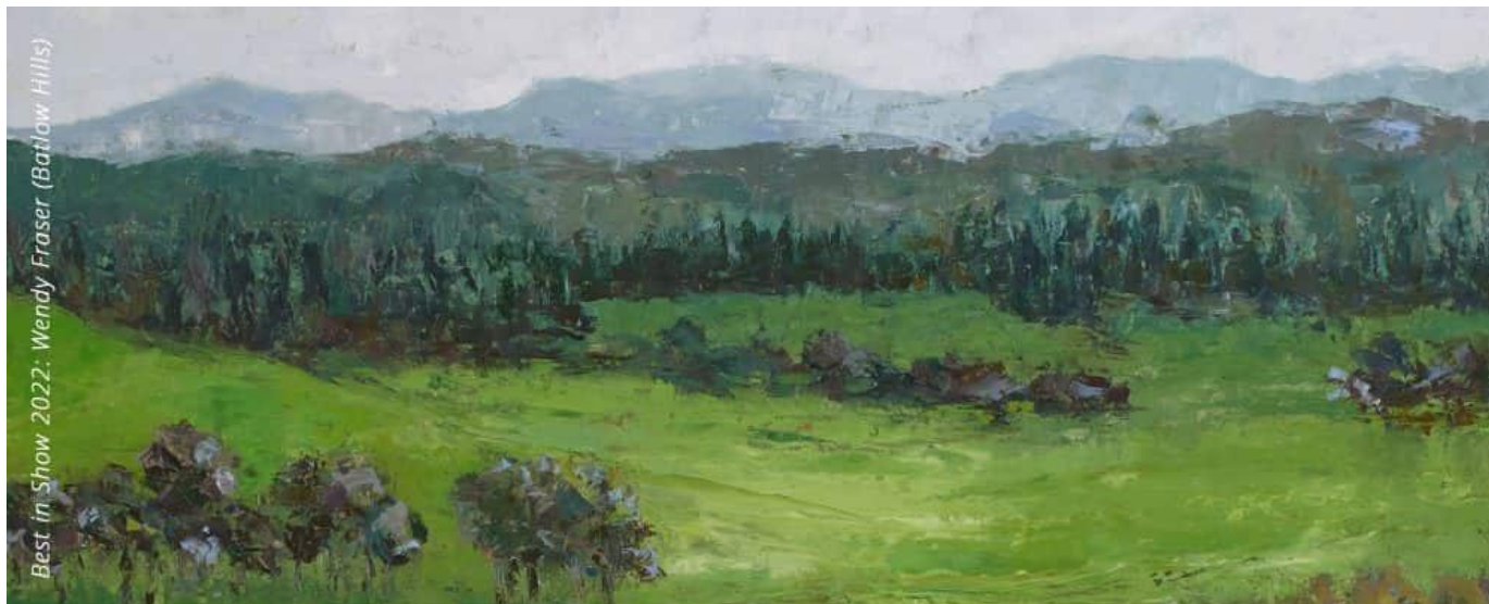
Best in Show 2022: Wendy Fraser (Batlow Hills)