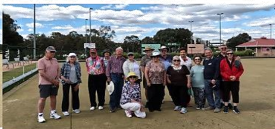
The Lawn Bowls Team 2022