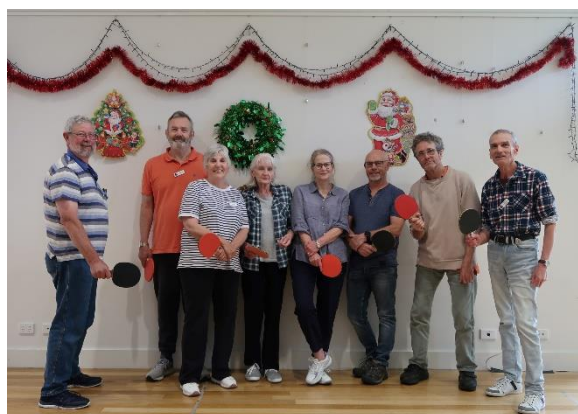
Some of the Table Tennis 'Crew'

We are a friendly fun group always ready to welcome new players. Depending on the number of players we play both doubles and singles and rotate so everybody gets to team up and/or play against everyone else. If you have not played before or maybe you are a bit rusty, don't worry as we will be only too pleased to give you some guidance and practice time so that you can ease into the game or maybe find your old form. Bats are provided or you can bring your own.