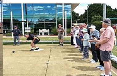
Lining up for a 'Corner to Corner'