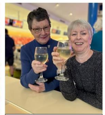
Cheers! Things people get up to at the Bowling Alley!

It's been a busy year for the group with our numbers steadily increasing up to 46 and by popular demand we now bowl every Wednesday during school terms instead of fortnightly.